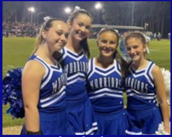
2023 SFJH Cheerleaders