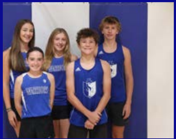
2023 SFJH Cross Country